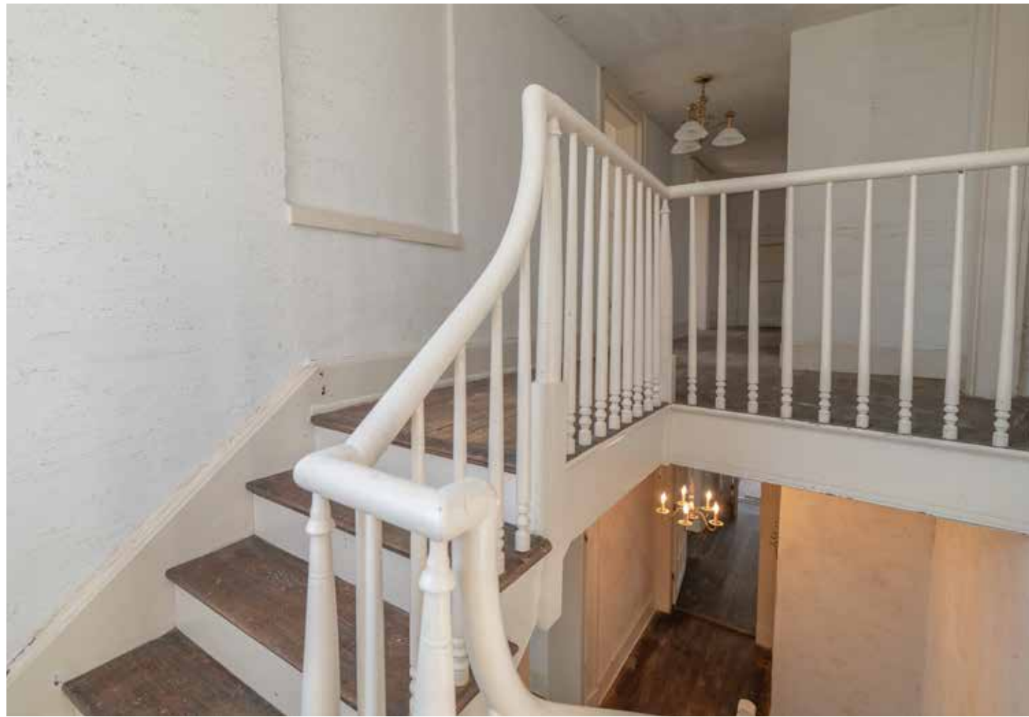
The Second Floor