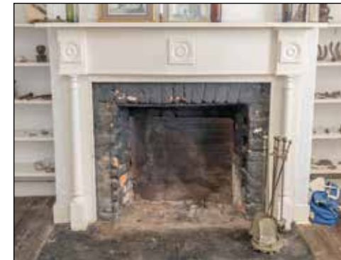
LIVING ROOM FIREPLACE