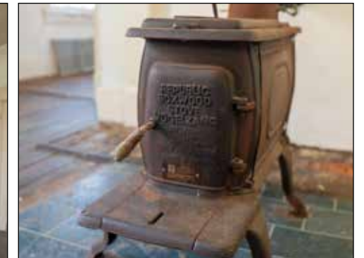
OLD REPUBLIC BOXWOOD STOVE