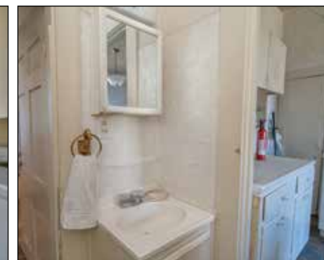
FIRST FLOOR BATHROOM