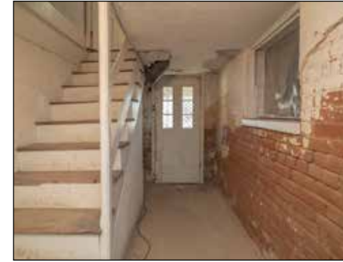
BASEMENT TO OUTSIDE