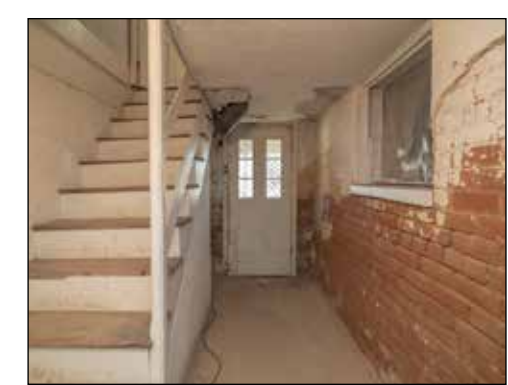
BASEMENT TO OUTSIDE