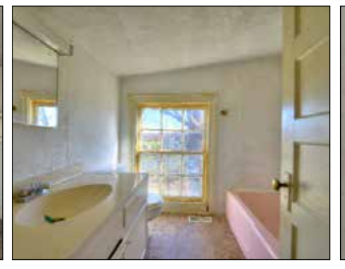
Bedroom 3 UPPER BATHROOM