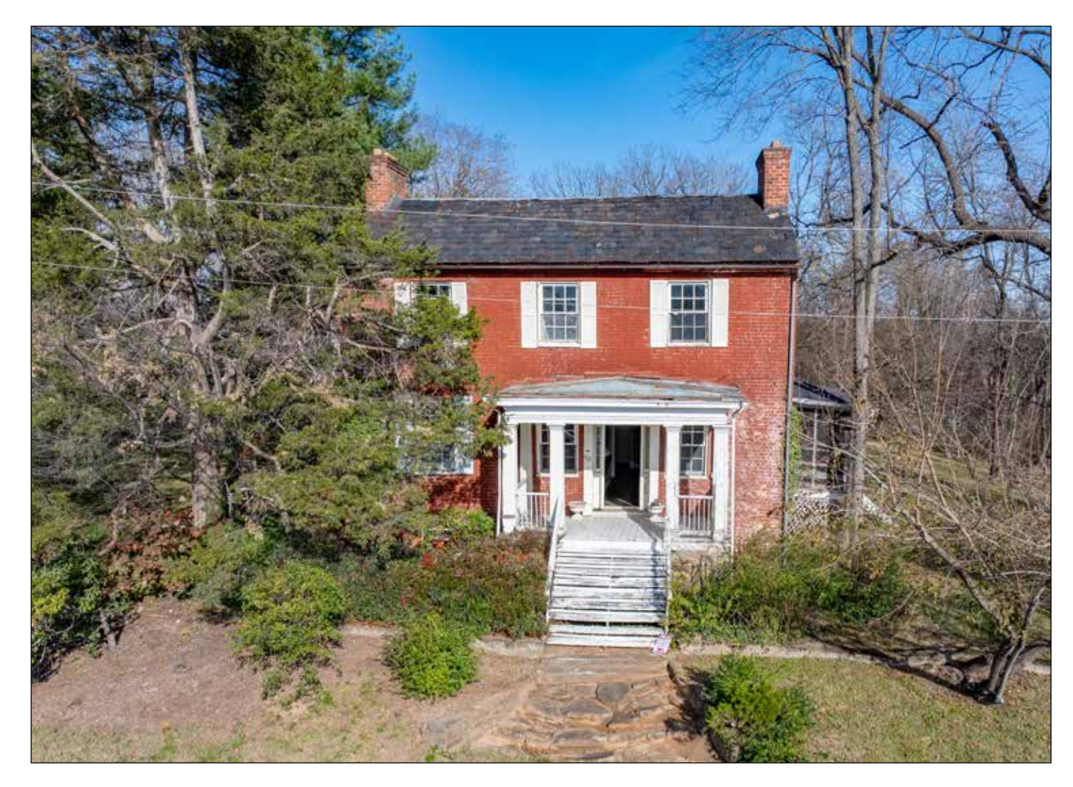
A Historic Treasure Awaits Your Vision The c.1830 Fishback House in Jeffersonton

At the edge of Jeffersonton, a historic village founded in 1807, stands the Fishback House, an important home in need of restoration to regain its former glory. This two-story red brick home, built around 1830, is rich in history and connected to the Fishback family, the Civil War, and Thomas Jefferson's travels. In 1861, the Little Fork Rangers Calvary assembled in front of this house to receive their flag before marching off to the Battle of Manassas. In the front room of the house, the ladies of the village sewed the battle flag so the Little Fork Rangers could receive it on the front steps and march to the second battle of Manassas. Legend has it that Thomas Jefferson used to stop at the house en route from Charlottesville to Washington. On one of those visits, he planted several willow trees. The town bustled with activity as the old Washington Road ran directly through its center, bringing stagecoaches that stopped three times a week. The home has borne witness to countless historical moments.